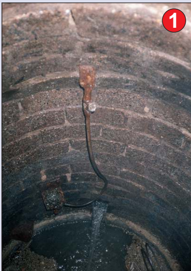
1. The problem - walls under chemical attack with active water leaks...