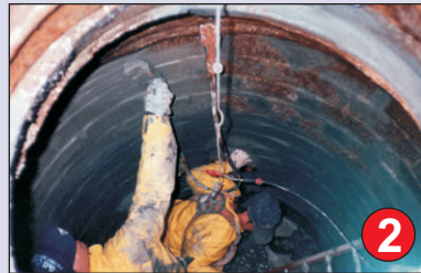
2. After active leaks have been plugged with ENECRETE® WP, the walls are brushed with two coats of WS - the water sealer.